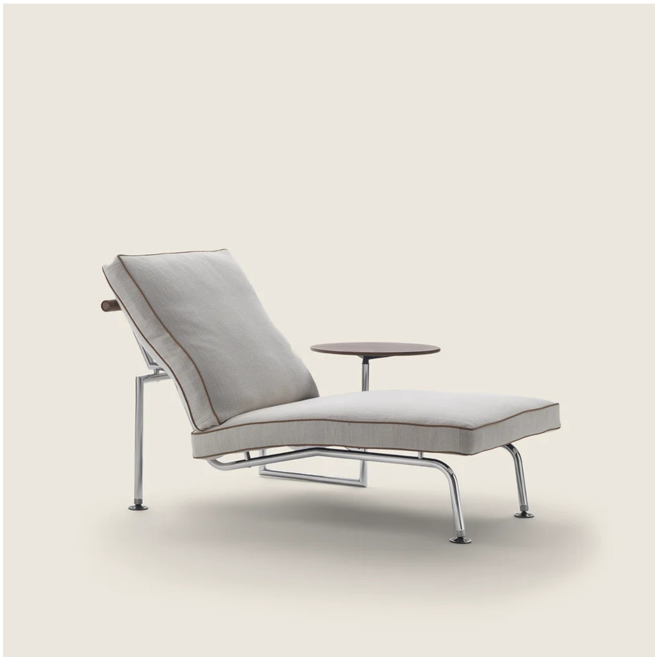
GINGER ANTONIO CITTERIO 1984 CHAISE LONGUE/DORMEUSE