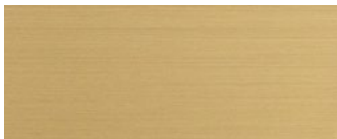
ottone satinato satin brass