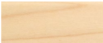
acero miele honey maple